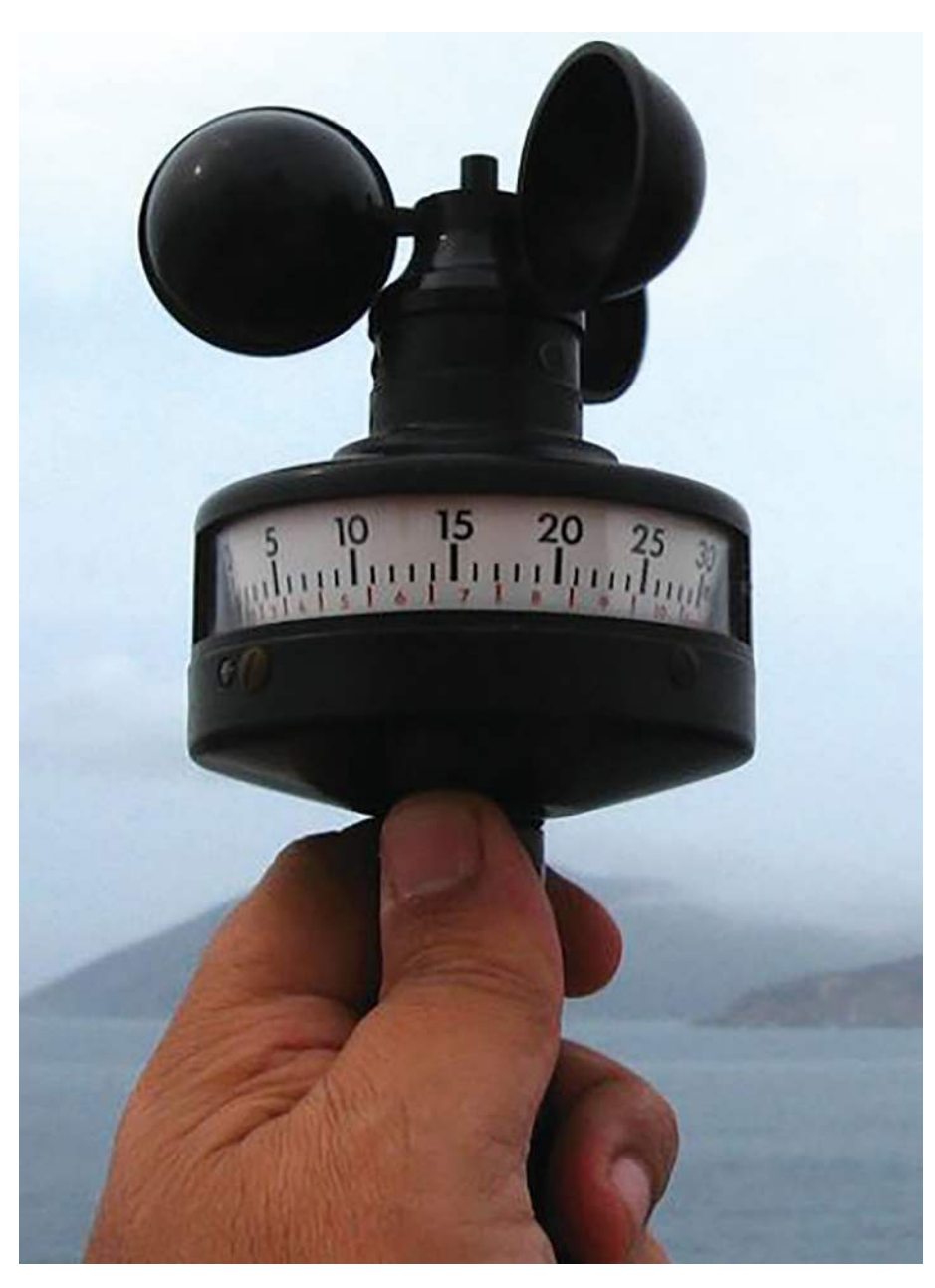
Table 2.2 for Question 2